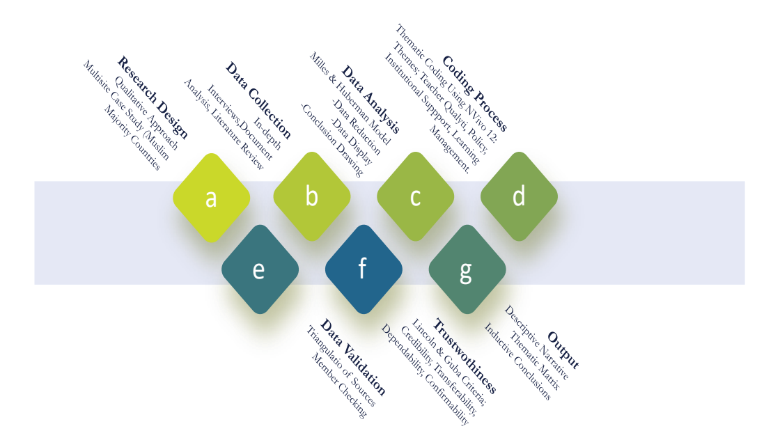
Fig 2. Research Flow Diagram (Qualitative Multisite Case Study)

field findings. The collected data were analyzed using the interactive model from Miles and Huberman, which consists of three main steps: data reduction, data presentation, and drawing conclusions (Febriyanti et al., 2024; Handoko et al., 2023; Rahman, Kaema, et al., 2024). The data reduction process was carried out by sorting relevant data from interview transcripts, documents, and literature to then be coded based on main themes such as teacher quality, national policies, learning management, and institutional support. After that, the data was presented in the form of descriptive narratives and thematic matrices to facilitate the data collection process, by utilizing the help of NVivo 12 software to systematically map categories and relationships between themes (Delavari et al., 2020; Everythinget al., 2022; Engkizar et al., 2023). Conclusions are drawn inductively, based on patterns that emerge from data interactions, and validated through source triangulation and member checking with a number of key informants. To maintain the validity and integrity of the data, this study applies four qualitative validity criteria according to Lincoln and Guba, namely credibility, transferability, dependability, and confirmability. The entire flow of this research can be seen in Figure 2 below: