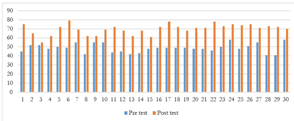
Fig 1. Histogram of post test results of early childhood social development based on multisensory-ecology-based science learning and inquiry model

To describe the condition of early childhood cognitive development of the pretest and posttest groups, see Figure 1.